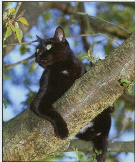
It's not always true that a cat stuck in a tree will find its way back down.

Rescue Service began seven years and 500 cat rescues ago, when he received a call from a distressed customer asking for help.